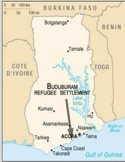
The Buduburam Refugee Settlement is located approximately 30km outside Accra, the capital of Ghana.

“Kids now come to school on time, learn well, are happy at school and no longer sleep in class, and this is good news for us all.”