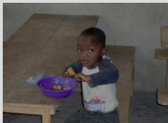
Carolyn A. Miller School student eating his daily meal